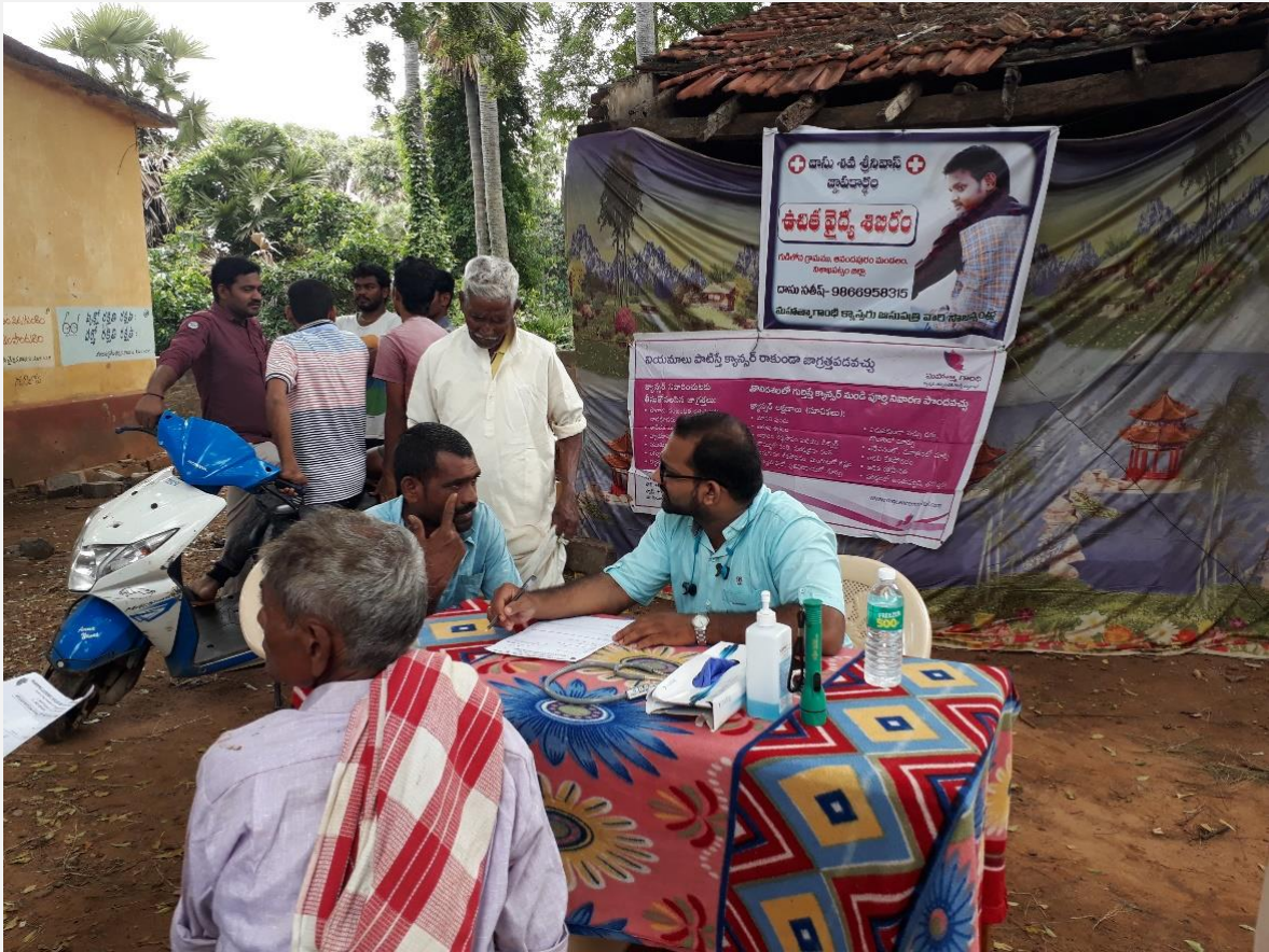
Screening Camps in Progress