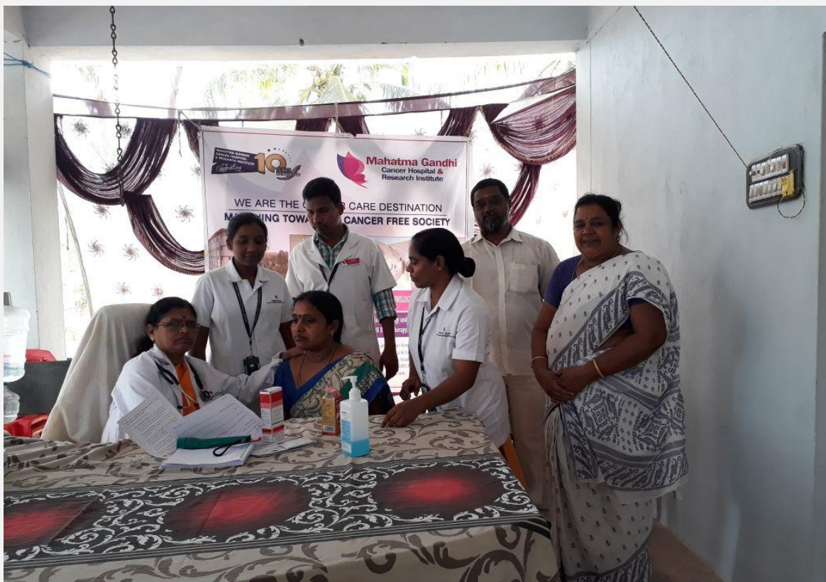
Screening Camps in Progress