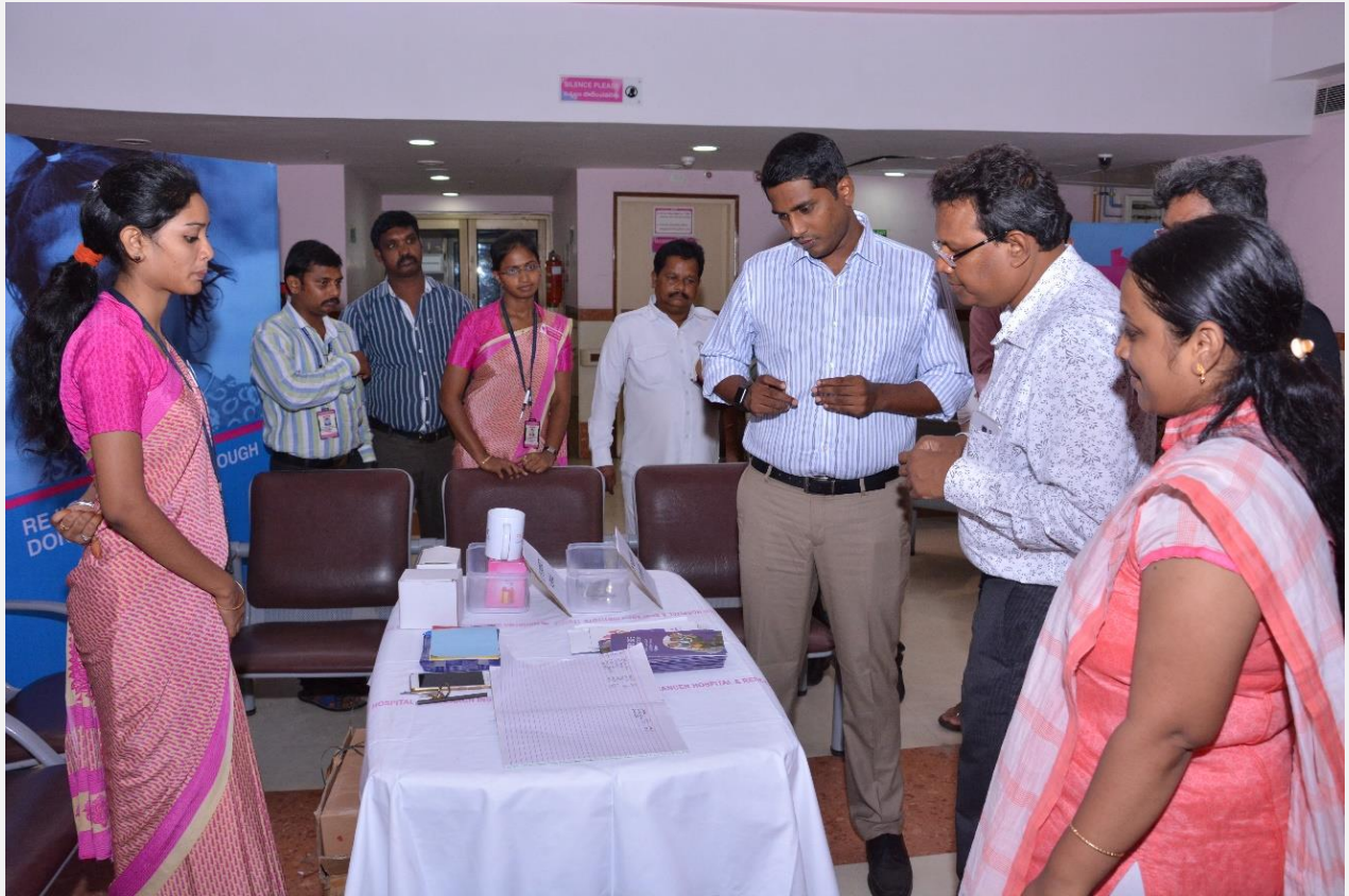
Screening Camps in Progress