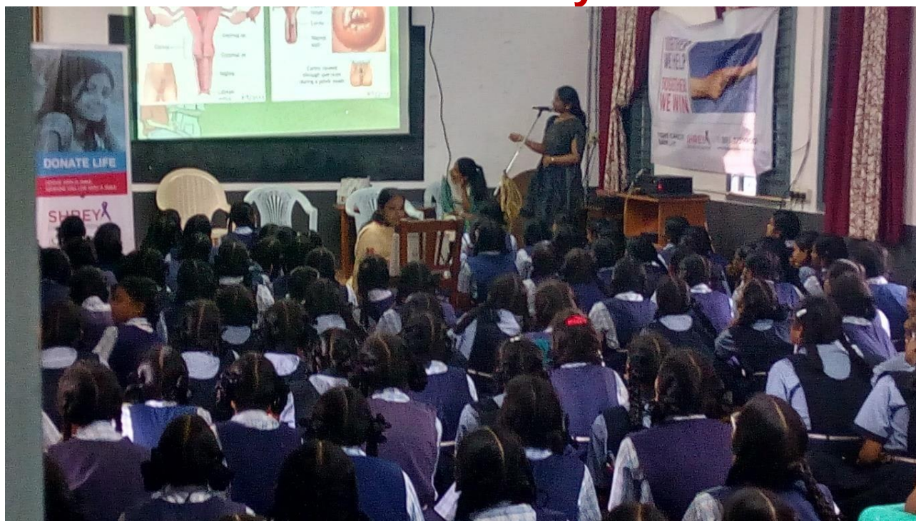
Awareness to school students before HPV vaccination administration